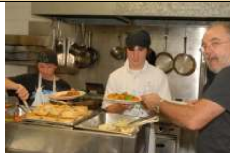
Boys from Toogoolawa School serving in Soul Cafe