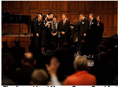
The Annual Lord Mayors Prayer Breakfast

As well we had a super visit to Toowoomba for Sue's mums 80th!