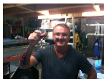
and the tasting