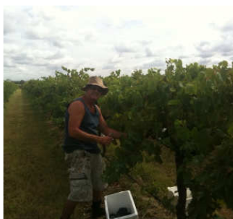
picking the vines