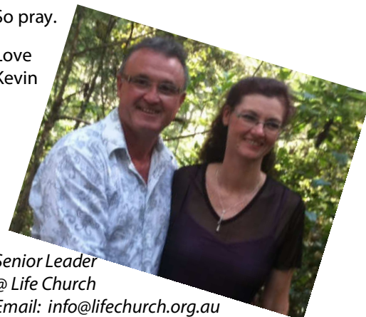
Senior Leader @ Life Church Email: info@lifechurch.org.au

Twin Packs available of 'Lessons from James' $12.00 plus postage