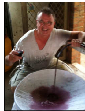
Be blessed and prosper.

We can live with a confidence in His words concerning His promise of blessing, for God is not a man that He should lie or the Son of Man that He would change his mind. He has said it, He will do it. He has spoken it, He will make it good.