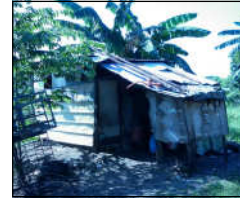
A Squatters House