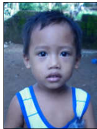
My sponsor child

The main centre where we stayed was Graceville in the province of Bulakan and we visited centres at Patulo, Tupda, Pabahay, Bagong Silang, Decca. All these centres reach out to the needs of the children and their families. Along with the educational needs, there was also a strong emphasis on the word of our Lord. Many attended church and are rewarded in this way. You could see them being strengthened in many ways.